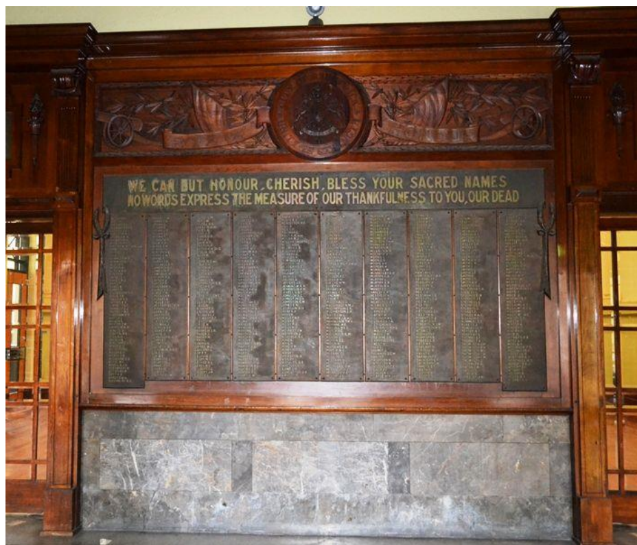
Brunswick Town Hall Honour Roll

J. Podmore is remembered on the Brunswick Town Hall Honour Roll located in Foyer of Brunswick Town Hall, 233 Sydney Road, Brunswick, Victoria.